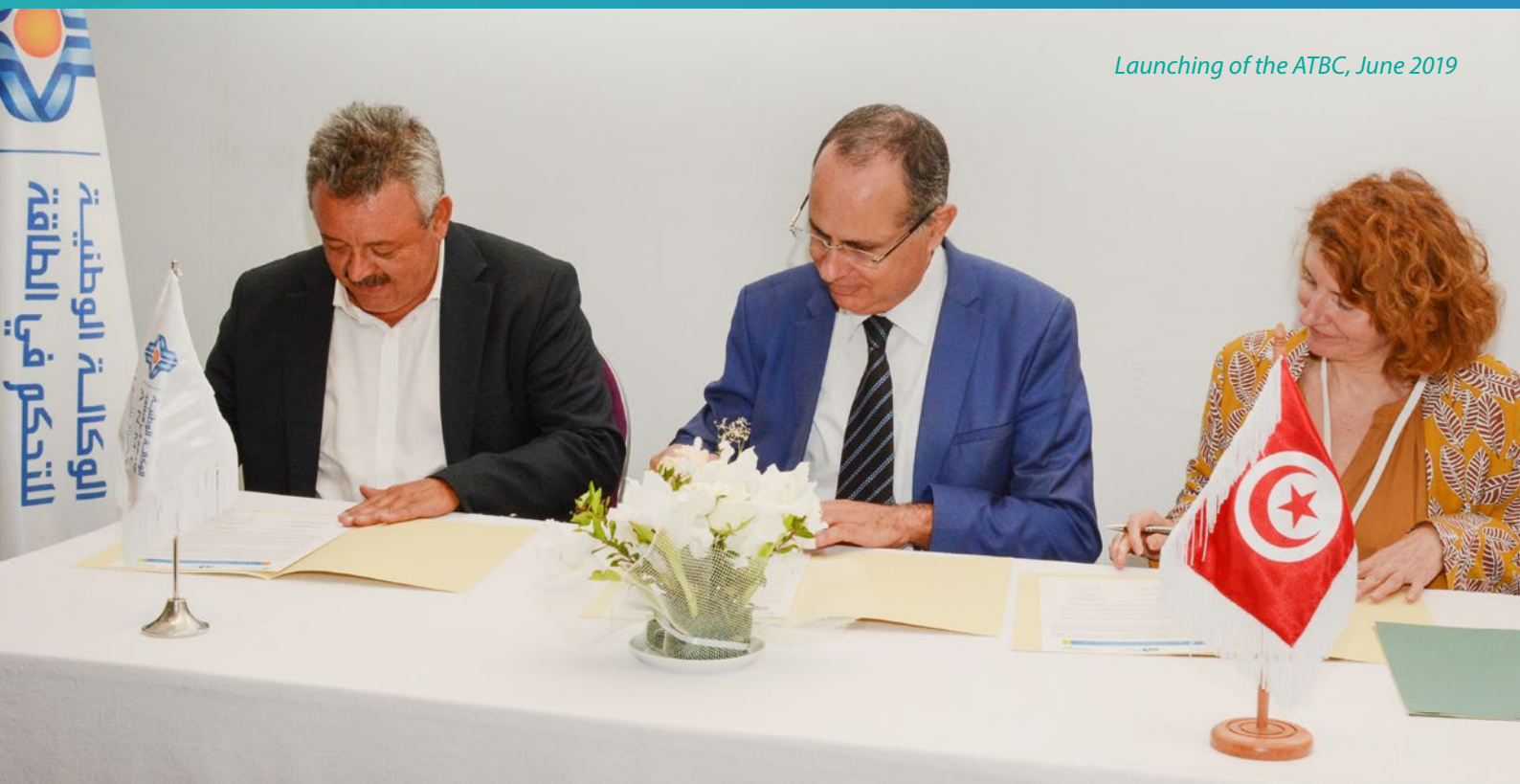
Launching of the ATBC, June 2019