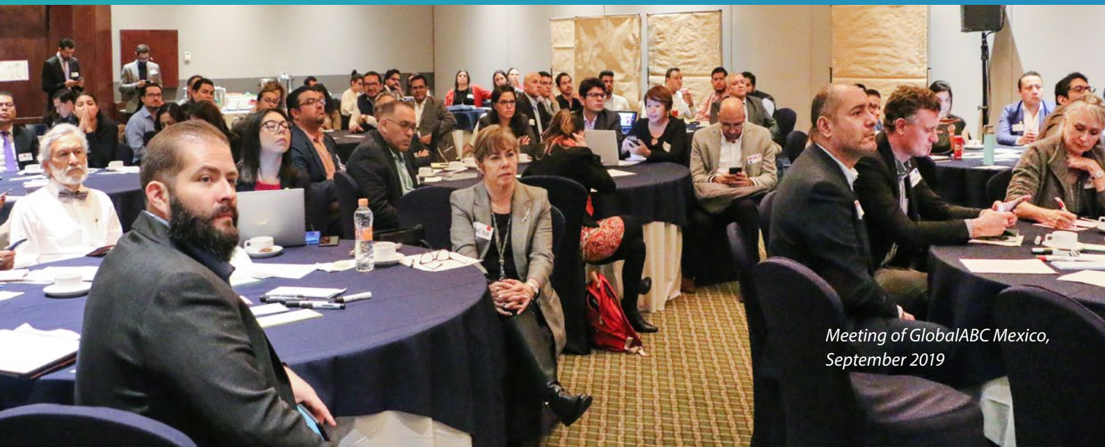
Meeting of GlobalABC Mexico, September 2019